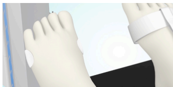
ADHESIVE VELCRO COIN 2006-65

Used for patients in the prone position.