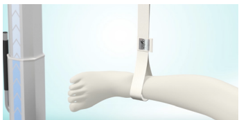
LIFTING STRAP 2006-70-1

Supports: arm, fingers, forefoot and ankle.